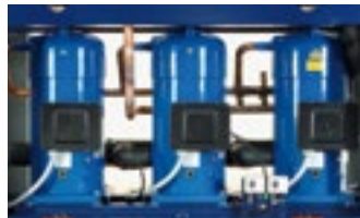
Optimised performance thanks to multiscroll logic.