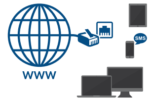
External supervisor systems.