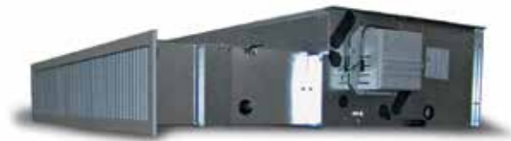
Crystall Flex System

Even though it is possible to reduce pollution in the ducts through adequate periodic maintenance, the truth is that this rarely happens, due to the significant costs involved, difficulty of access or impossibility of stopping the system for a prolonged period of time.