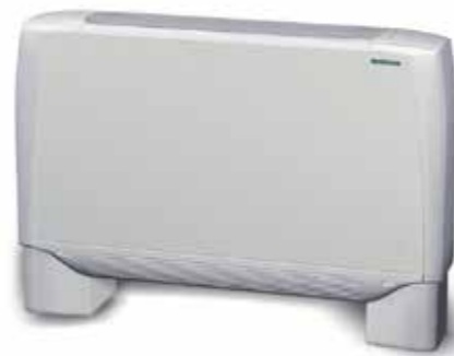
Carisma fan coil unit

Based on efficiency tests carried out at the Polytechnic Institute of Turin, the filter was classified Class D according to UNI Standard 11254:2007, with performance similar to initial performance levels of a traditional mechanical filter certified Class F9 in accordance with UNI Standard 779:2012.