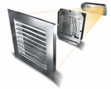
Crystall Duct System

The causes for the presence of pollutants in air ducts are many. The main reason is inadequate or poor cleaning and maintenance on the ducts, or lack of it all together, and other factors, including improper balancing and/or pressurization of the ducts, circulation of air between one space and another while the system is off, the lack of suitable filters or air bypassing the filtering cells in the air handling unit, as well as humidity, proliferation of bacteria, etc.