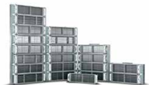
Modular Crystall for AHU